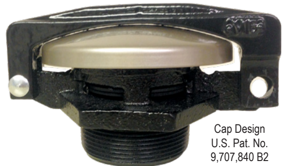
Cap Design U.S. Pat. No. 9,707,840 B2

Individual Dimensions: 4" x 5½" x 3" Individual Weight: 2.05 lb Carton Qty: 6 each Carton Size: 13" x 10½" x 3¾" Carton Weight: 12.75 lb Fits 2" NPT Openings Powder Coated Finish MADE IN USA