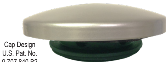
Cap Design U.S. Pat. No. 9,707,840 B2